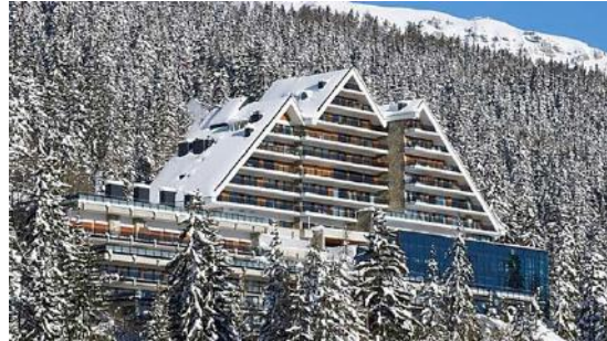
Hotel Crans Ambassador Crans-Montana