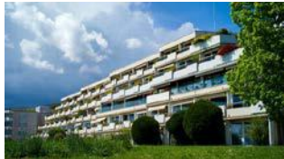
Clinique de Genolier 1972/2002