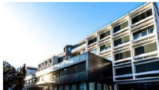
Clinique de Valère 1920/2012