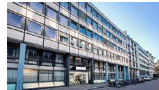
Schmerzlinik Basel 1978/2014