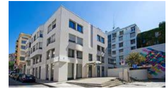
Centre des Eaux-Vives 1968/2009