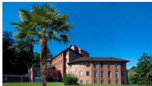
Clinica Sant'Anna 1922/2012