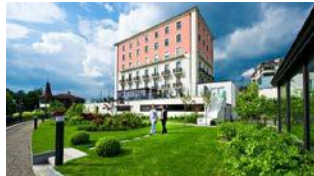
Clinique de Montchoisi 1935/2003