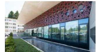
Clinique Montbrillant 1909/2015