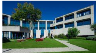
Clinica Ars Medica 1989/2012