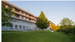
Privatklinik Lindberg 1906/2011