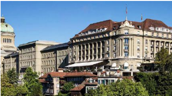
Bellevue Palace Bern