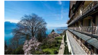
Clinique Valmont 1905/2006