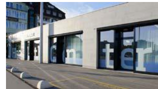
Ärztzentrum Solothurn 2012/2018