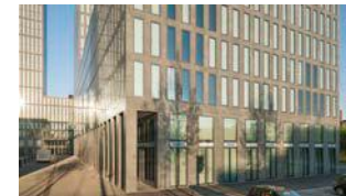
Ärztzentrum Zürich 2013/2018