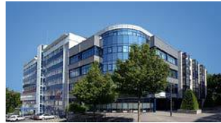
Clinique Générale 1908/2005