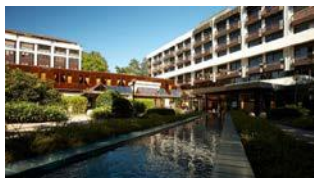
Clinique Générale-Beaulieu 1899/2016