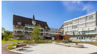
Privatklinik Bethanien 1912/2010