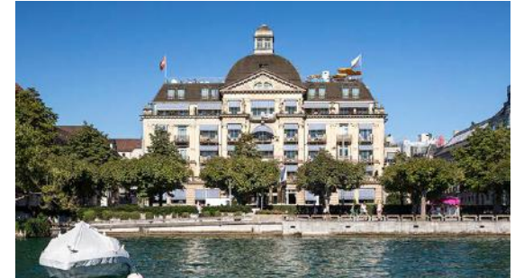
Hotel Eden au Lac (closed until mid-2019) Zurich