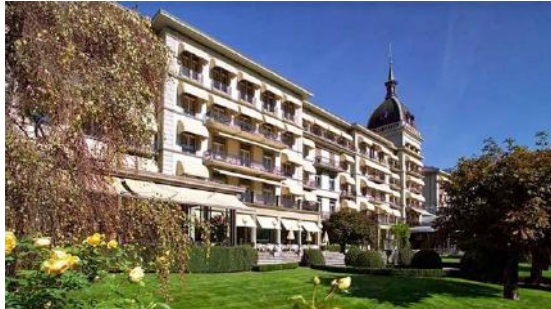
VICTORIA-JUNGFRAU Grand Hotel & Spa Interlaken