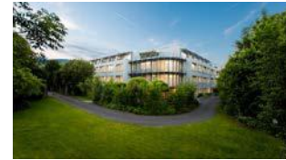
Privatklinik Obach 1922/2012