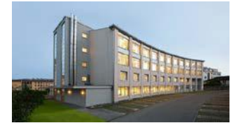
Hôpital de la Providence 1859/2012