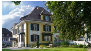
Privatklinik Villa im Park 1984/2013