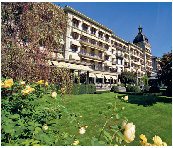
Hospitality Victoria-Jungfrau Collection

Victoria-Jungfrau Collection operates four leading five-star hotels situated in the most sought-after locations in Switzerland: Victoria-Jungfrau Grand Hotel & Spa in Interlaken, Palace Luzern, Eden au Lac in Zurich and Bellevue Palace in Bern. The four hotels are individually managed but all share a commitment to personal hospitality and top-quality service. The historic establishments with Swiss tradition offer luxurious accommodation, gourmet cuisine, wellness and contemporary infrastructure to their guests. The Victoria-Jungfrau Collection yearly counts around 170'000 overnight bookings.