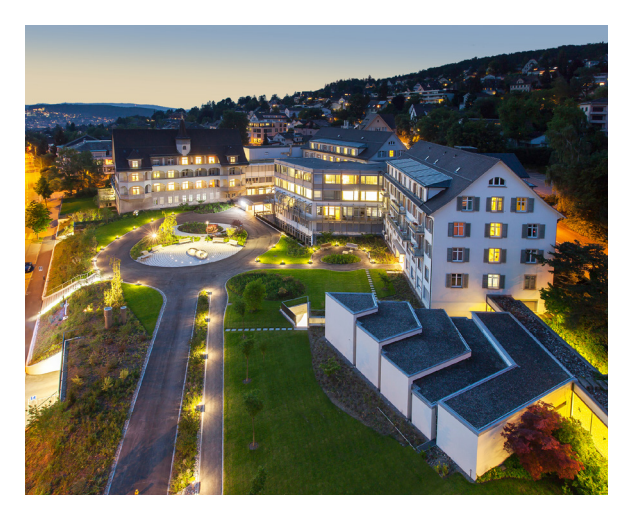
Hospital and Hospitality Real Estate

AEVIS VICTORIA's real estate portfolio is composed of healthcare and hospitality real estate and organised in two dedicated entities. The total real estate portfolio counts 41 properties on 17 sites, representing a rental surface of approx. 175'000 sqm and a market value of CHF 940 million.